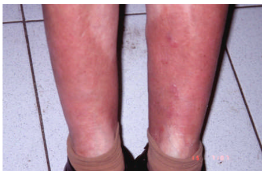
Figure No. 14.