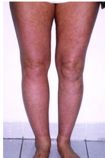
4 weeks after treatment

Consolidation 95%. The treatment continues. Consumption 1 set. Lasts slight erythema, it does not itch. Tolerance good. Internal, laboratory and histological finding within the bound of normal. Absolute satisfaction compared to previous therapy.