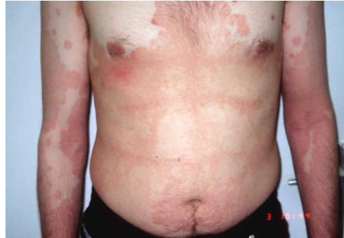
4 weeks after treatment

The treatment continues successfully. The status improved in the meanwhile on 60%. Persist mainly pigment areas, sporadic slight erythema. The therapy is well tolerated. The patient consumed in the meanwhile 4 sets. Internally without problems, laboratory idem. Histological finding: Lasts slight hyperkeratosis. Recommended tonsillectomy.