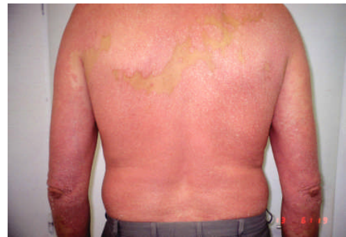
4 weeks after treatment

Consolidation 85%. Lasting mauve areas withdraw of methothrexate. Dr. Michaels therapy continues. Consumption in the meanwhile 3 sets. The articular disorders on hands and feet last. Course without subjective complications. The patient is satisfied, he evaluates the results very positive comparing to the previous therapy. Laboratory finding after one month of treatment: Hepatic tests improved, total bilirubin from 32 mmol/l to 24, ALT from 122 mkat/l to 85 and GMT from 113 mkat/l to 78. Cholesterol 6,2 mmol/l, triacylglycerols 2,4 mmol/l. Otherwise normal. Histological finding: persist slight lymphocytar infiltration in upper corium, slightly augmented capillaries and imperceptible acanthosis.