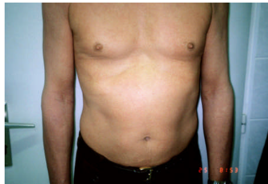
8 weeks after treatment

Consolidation 100%. The patient further monitored. Consumption 3 sets. Other remedies were not used. General clinical status and histological finding after the therapy completely normal.