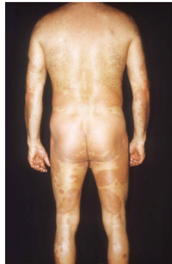
6 weeks after treatment

Consolidation 85%. Therapy continues. In the meanwhile applied 3 sets. Other remedies were not used. Last slight pigmentations. We could evaluate the results of the therapy on 90%. Tolerance good. Laboratory finding: creatinine decreased to 128 mmol/l and blood pressure to 160/75 mm Hg. Otherwise normal. Histological finding: Apart from slight hyperkeratosis normal.