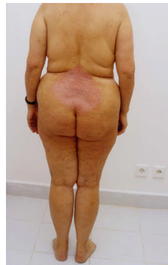
4 weeks after treatment

Consolidation in the meanwhile 55%. The focus smaller, the erythema lasts. The therapy continues. Consumption 1 set. Lasts higher glycemia 7,4 mmol/l and hypercholesterolemia 8,2 mmol/l. Blood pressure 150/80 mm Hg. Histological finding: Lasts inflammatory infiltration and acanthosis with parakeratosis. The patient indicates as a side effect a temporary burning in the first days after the application of Dr. Michaels remedies. Further diet.